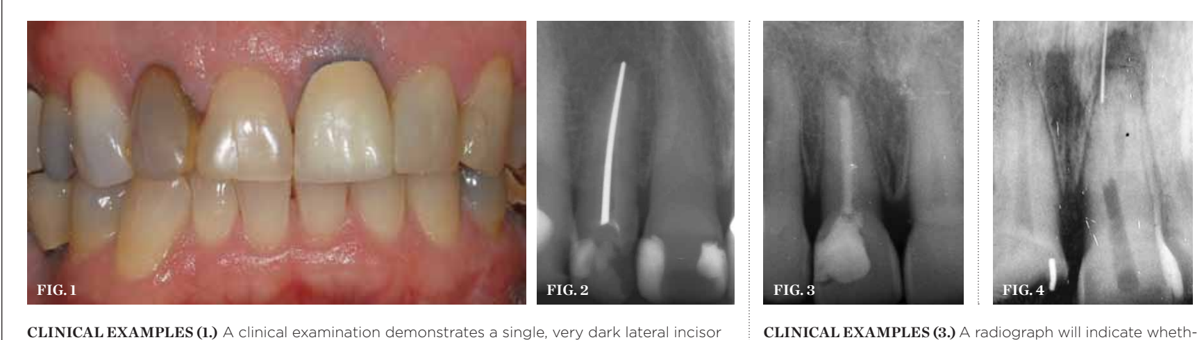
CLINICAL EXAMPLES (1.) A clinical examination demonstrates a single, very dark lateral incisor and a moderately dark central incisor with a crown on the adjacent central incisor and several dark gingival areas. (2.) A radiograph finds no pulp chamber in the slightly dark central incisor and a silver point on the darkest lateral incisor. A titrated approach to bleaching was needed using individual tooth treatments.

An improvement on this concept is the use of the "single-tooth" bleaching tray when one tooth is darker, but the other teeth are reasonably acceptable (Figure 6). In this tray design, a conventional non-scalloped, no-reservoir tray is fabricated. Then the teeth molds on either side of the dark tooth are removed (Figure 7 and Figure 8). The patient is given one syringe of bleaching material and applies it only to the single dark tooth mold and sleeps in the appliance. Teeth will bleach at different rates and to different color levels. The goal is to determine how light the single dark tooth will bleach first. If the color of the single