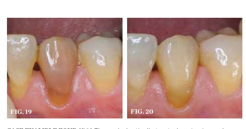
CASE EXAMPLE FOUR ((19.) The endodontically treated canine is much darker than the adjacent teeth, but in this less-esthetic area, a full tray was used to lighten all the teeth. The canine was bleached internally with one treatment and externally to completion. (20.) After 3 weeks of external bleaching with 10% carbamide peroxide at night, the adjacent teeth reached their maximum lightness. While the other teeth are slightly lighter than the canine, the color match was much closer and pleasing to the patient.

The single dark tooth is an esthetic challenge regardless of the treatment approach. Bleaching the single tooth alone is the safest, most conservative approach to determining the response of the single tooth before changing the